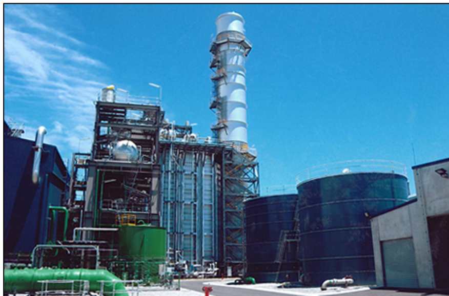
The Kwinana Power Plant (WA)

In Australia, secure economic growth and continuous increase of power demand is expected. Sumitomo will continue to seek opportunity to expand our business to accumulate good power assets in Australian market.